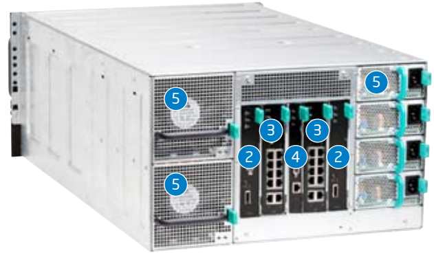
Figure 1. Intel® Modular Server integrates multiple levels of infrastructure in a single chassis: